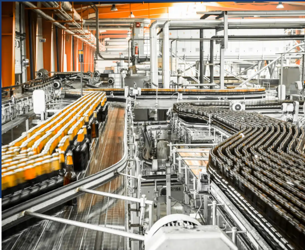
Automated beverage packaging production line

SupplyOne helped the customer quantify time, cost, and material savings and provides ongoing equipment service, operator training, and material selection support.