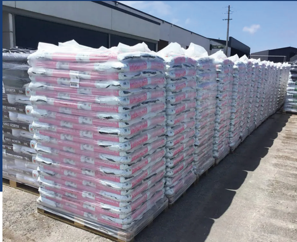
Fertilizer pallets wrapped with stretch film

SupplyOne standardized stretch film packaging for an agriculture and crop production supplier to improve pallet stability and material performance across distribution.