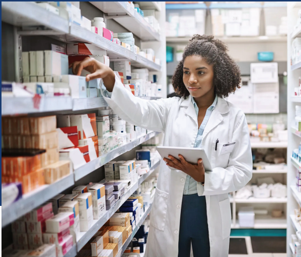
Medical & Pharmaceutical packaging solutions by SupplyOne

Implemented tamper-evident tape to enhance package security and integrity.