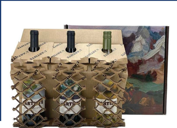
Custom winer shipper designed by SupplyOne

Designed protective inserts to secure bottles, minimize movement, and reduce breakage risk during shipping.